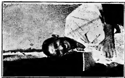
THREE CHARACTERISTIC PORTRAITS OF MR. GANDHI.